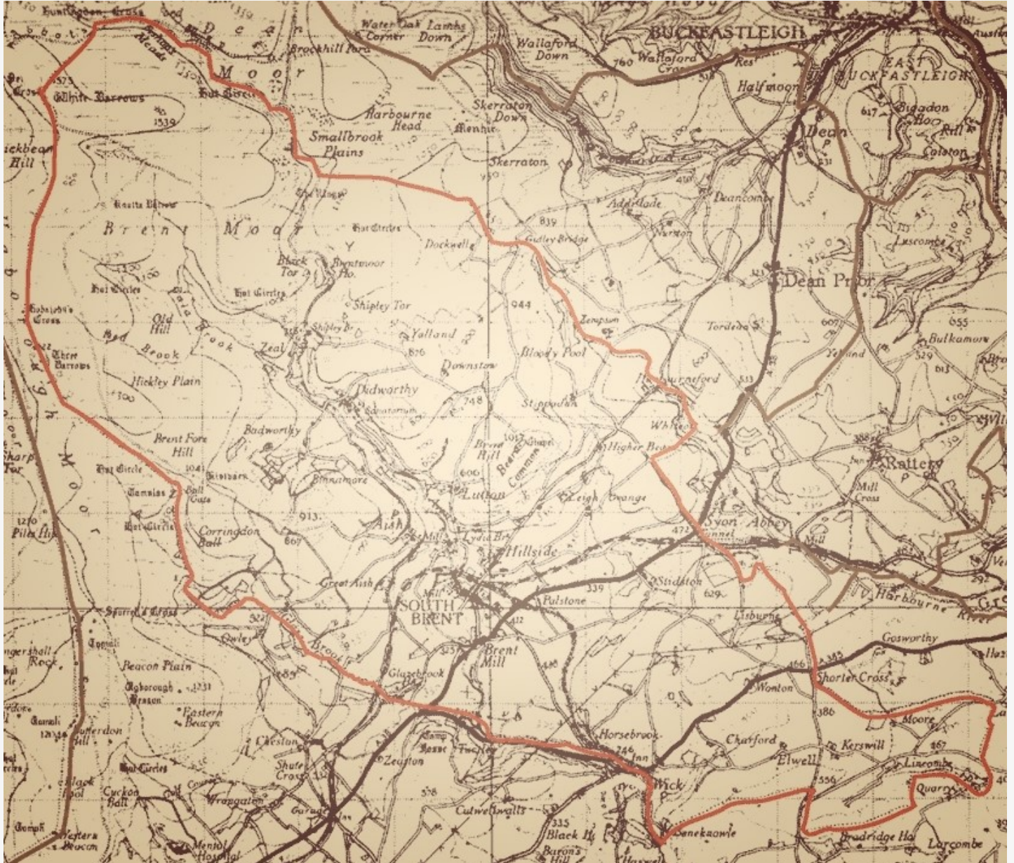
South Brent Parish Boundary 1850